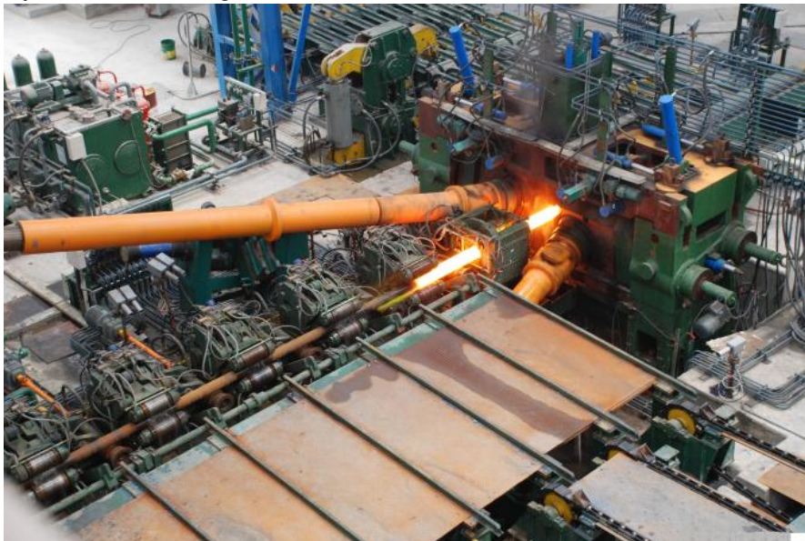
Steel Pipe & Tube Application: