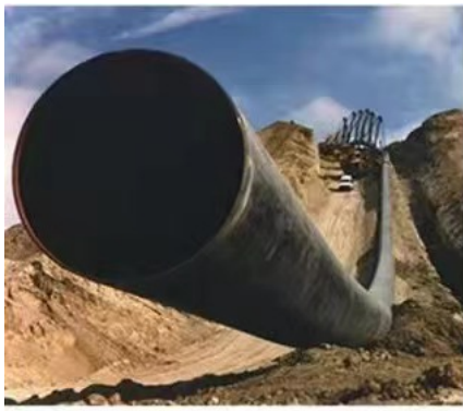
FLUID& GAS TRANSPORTATION