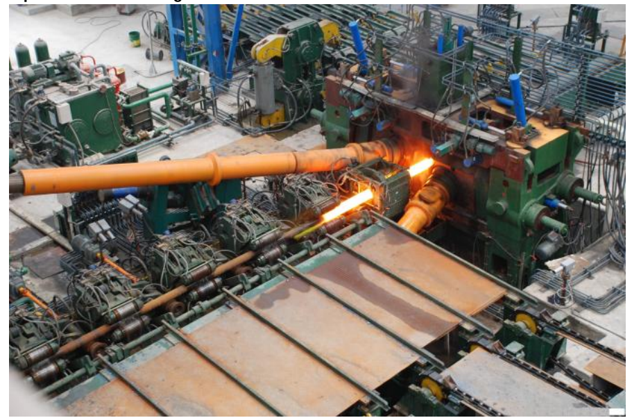
Steel Pipe & Tube Application: